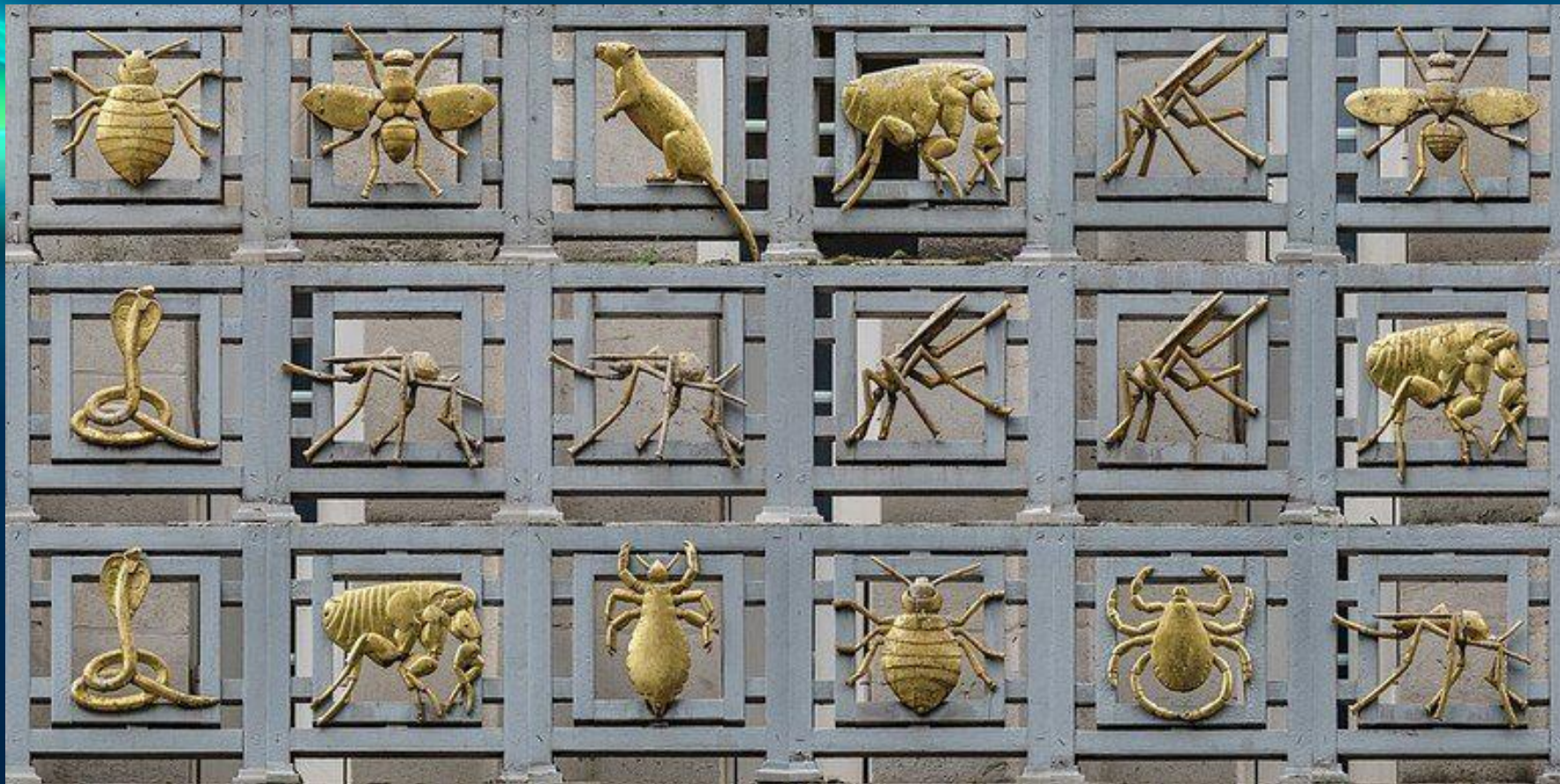
London School of Hygiene and Tropical Medicine Vectors of Disease Frieze

“Public opinion, mass ideas, the tendencies of human desire and thought, are not at this time of the highest order, and the physical precipitation of these vague and inchoate thoughts distinguished by a vast similarity, and colored by selfish intent and personal behest, and based upon likes and dislikes, prejudices and longings, can be seen in the most interesting precipitation. The vast assembly of insects which now haunt our planet and cause increasing concern to the scientist, agriculturist, and all those dealing with the welfare of the human animal, are the direct result of thought precipitation. ” A Treatise on White Magic p.542