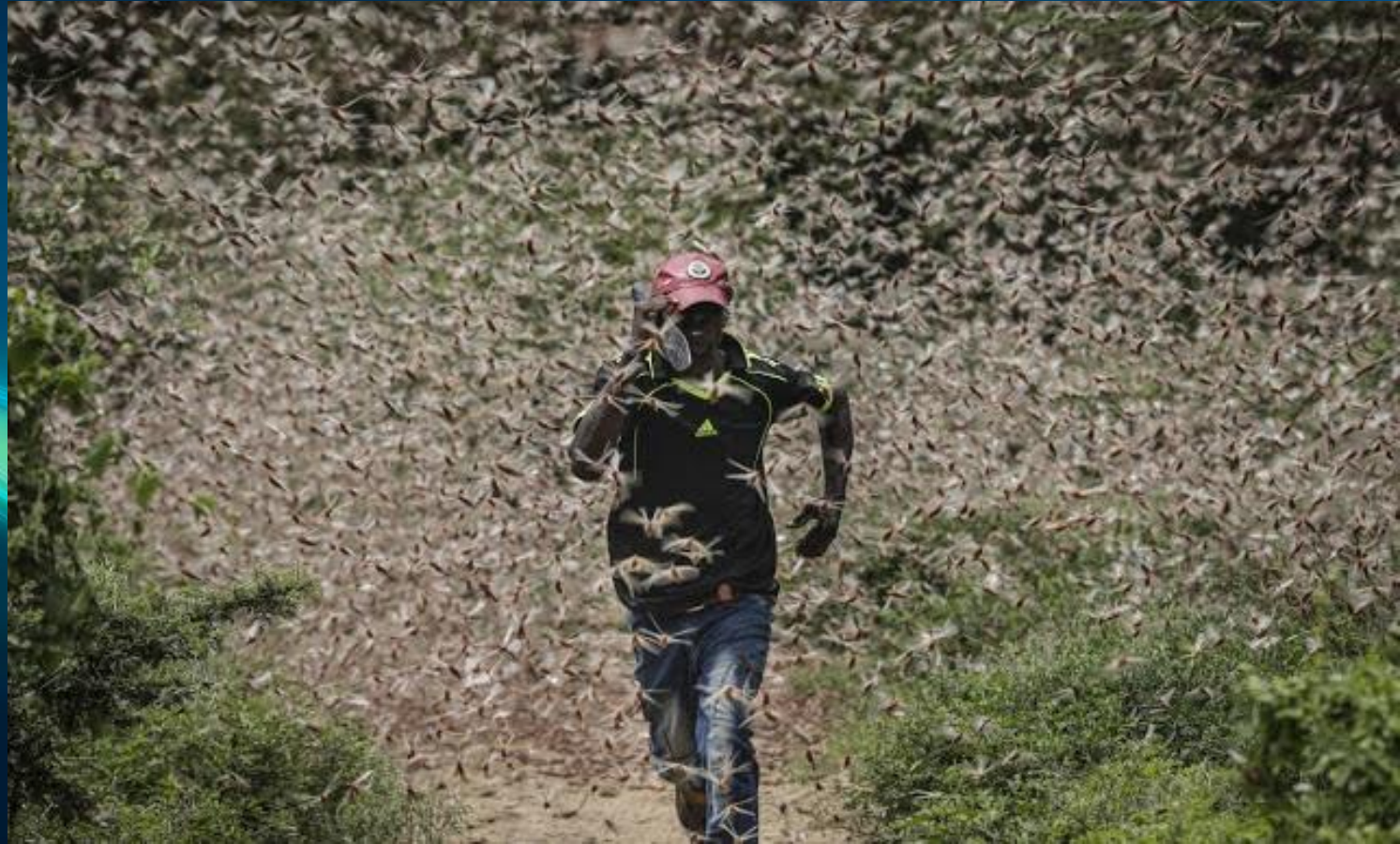
Billions of Locusts Swarm East Africa

In addition to this immediate crisis, ethnic tensions, religious rivalry and ‘ancient tribal hatreds’ have been a source of conflict in this region for decades if not centuries.