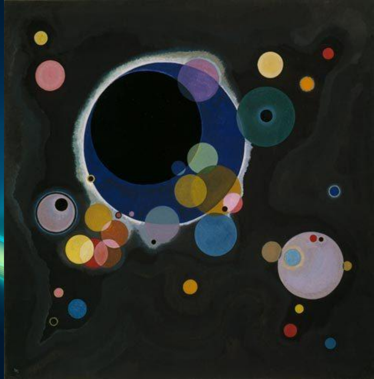
Wasily Kandinsky Several Circles (Einige Kreise), 1926.

To all it may be told how indispensable is unity. It has already been pointed out that unity is a real motive force. It has been said that unity is a magnet. It is a healer, health, it is rapid attainment. What is there still to be added? Aum , 433.