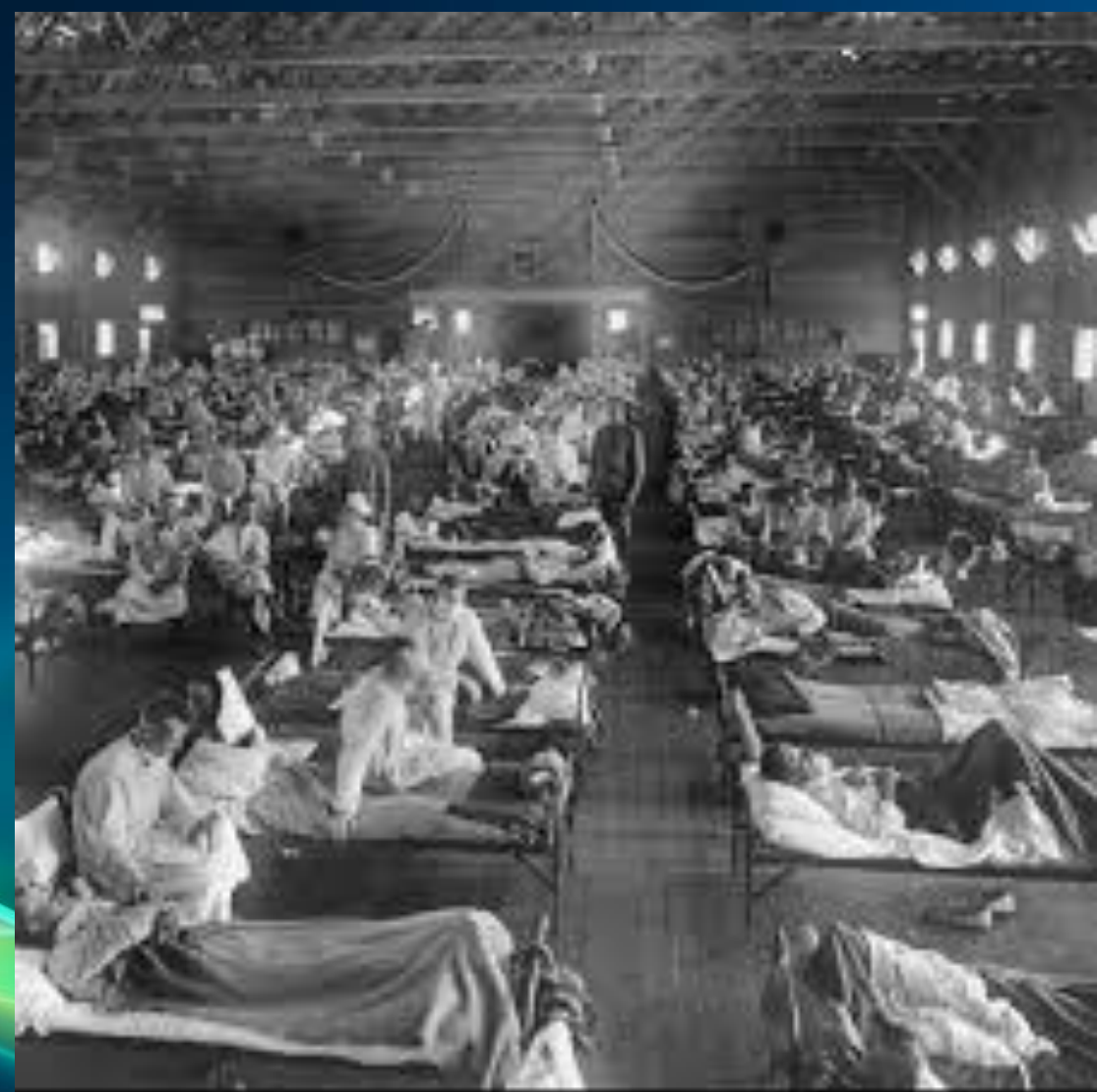
Victims of the influenza pandemic of 1918 crowd into an emergency hospital near Fort Riley, Kansas in 1918

Humanity, particularly in Eastern Europe, had not completely recovered from the epidemics, incident to the first part of the world war, when the second part took place. The psychological effects continue; the scars and the results of the second phase of that world war will persist for fifty years, even though—owing to man's greater scientific knowledge—the epidemic factor may be kept surprisingly within bounds. This, however, still remains uncertain. Time alone will demonstrate how successful humanity is in offsetting the penalties which outraged nature is apt to exact. Esoteric Healing p. 249